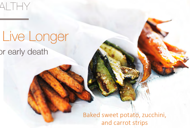
Baked sweet potato, zucchini, and carrot strips

Eating foods made with trans fats, like French fries cooked in oil, raises LDL "bad" cholesterol levels and the risk for heart disease.